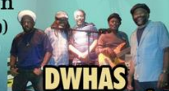
DWHAS Reggae Band

For information or tickets, please call: