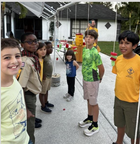
Visiting cub scouts and siblings