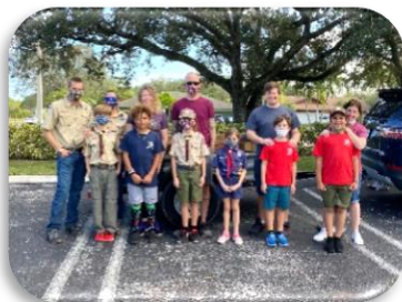
Cub Scouts and Parents

participated in the Scout Food Collection for the holidays. They collected over 1,400 pounds of canned and boxed goods and delivered it to a Palms West Presbyterian Church Pantry. The Church was extremely appreciative. The Scouts also helped out and contributed to the VAFMSF Yard Sale.