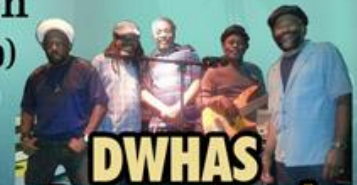
DWHAS Reggae Band