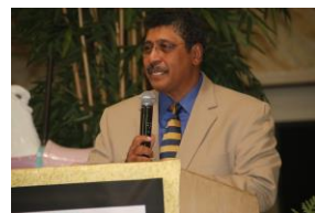
Mayor Fred Pinto