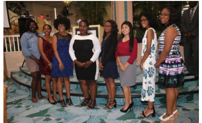
Student Assistance Award Recipients