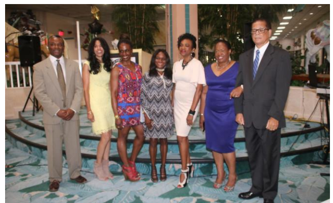
Student Assistance Committee