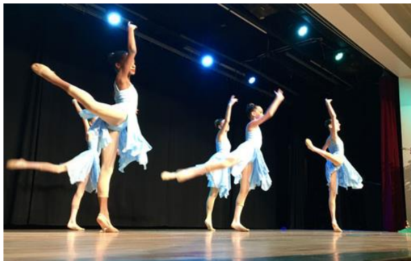
Momentum Dance Art Conservatory