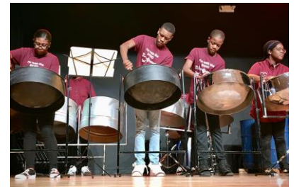
St. Christopher Steel Pan Orchestra