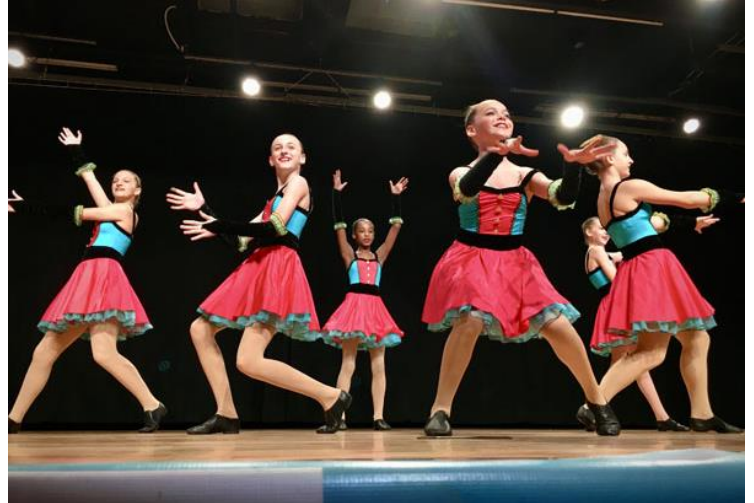
Momentum Dance Art Conservatory